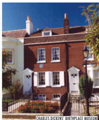
CHARLES DICKENS' BIRTHPLACE MUSEUM