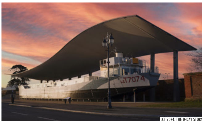
LCT 7074, THE D-DAY STORY