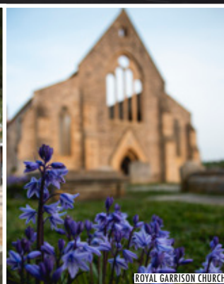
ROYAL GARRISON CHURCH